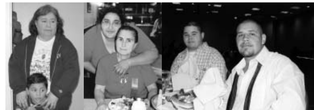
Family & Children Services helps build a better community, one family at a time