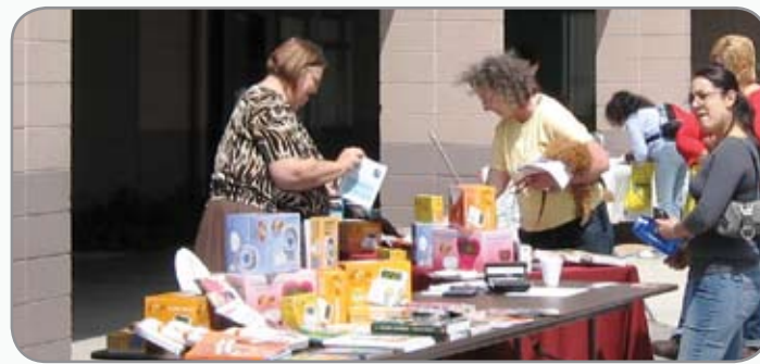
Families gathered information at resource tables throughout the day.