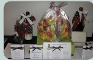
Family & Children Services held its first Chocolate & Wine event in October.