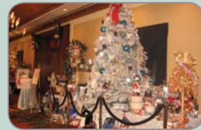
Lucky guests won beautiful trees like these at Christmas Tree Elegance.